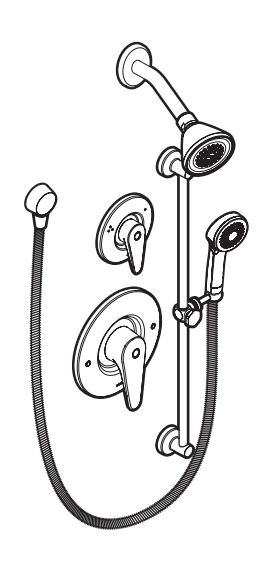
M•Dura™ Commercial Three-Function Shower System