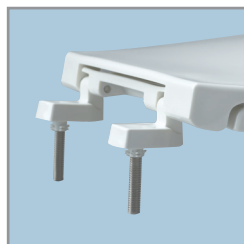
PLASTIC HINGES WITH STAINLESS STEEL POSTS AND PINTLES