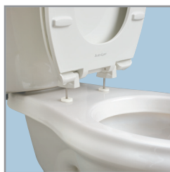
JUST•LIFT® PROVIDES 1-1/2" OF LIFT HEIGHT FOR ENHANCED CLEANABILITY