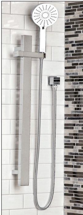
1662800 - Studio Slide Bar Kit