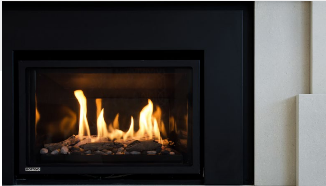
MONTIGO / ILLUME / 30FID / CONTEMPORARY