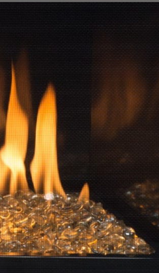
MONTIGO / ILLUME / 34FID / CONTEMPORARY