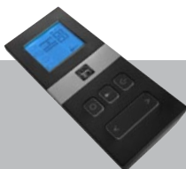
WALL REMOTE REC1493