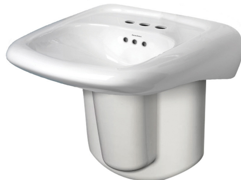
Shown with 0062.000EC shroud