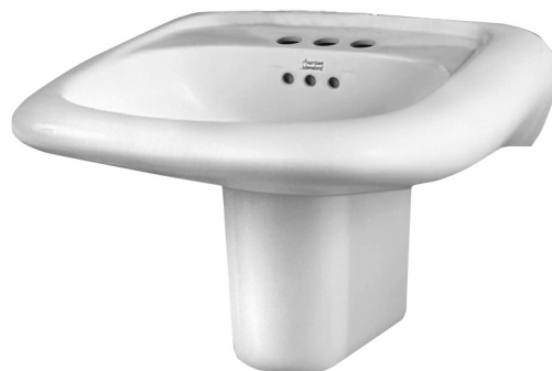
Shown with 0059.020EC shroud