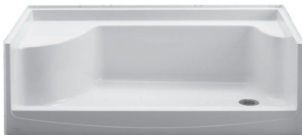
Model GR603L/R (GR603R Shown)

Length: 47 7/8" (1216 mm) Width: 37 1/2" (953 mm) Height: 21 3/8" (541 mm) Shipping Weight: 53 lbs. (24 Kg)