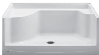
Model GR483L/R (GR483R Shown)

Length: 35 3/4" (908 mm) Width: 37 1/2" (953 mm) Height: 21 3/8" (541 mm) Shipping Weight: 44 lbs. (20 Kg)