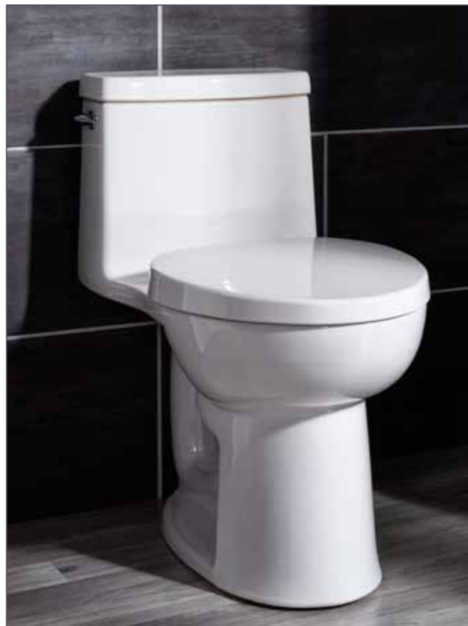
Right Height Elongated One-Piece Toilet 2535 I28