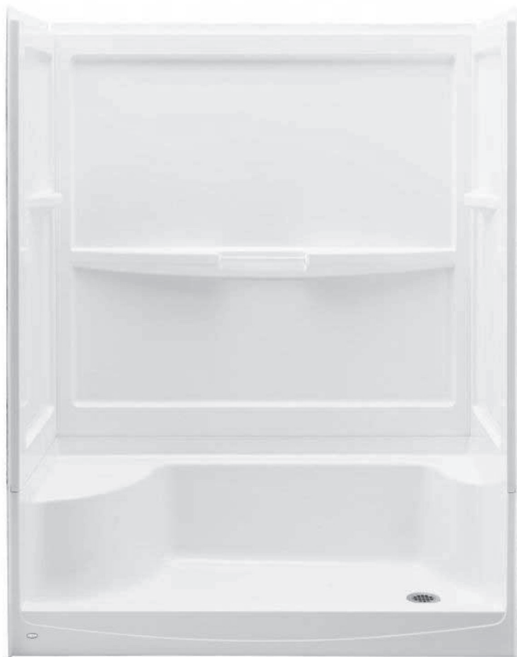
Model GR603R with 3063L/R Side Walls and 3663 Back Wall