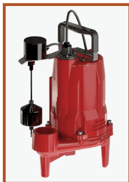
Vertical Float Switch Model PRG101AV

*Consult factory with actual application and head specifications prior to replacing LE40 and LE50-Series pumps.