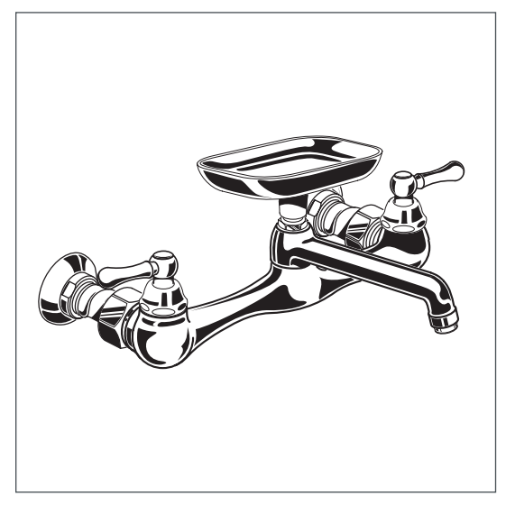
7295 152 Two-Handel Wall-Mount Sink Facuet