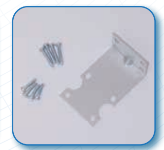
Mounting Bracket and Hardware