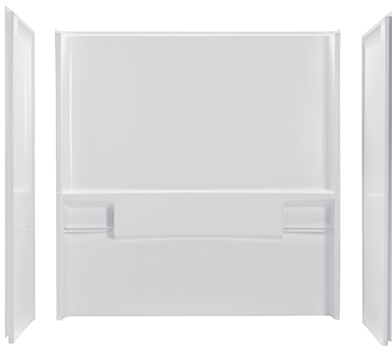
Model 5530L/R Side Walls and 5760 Back Wall

Materials: Gelcoat finish reinforced with fibreglass.