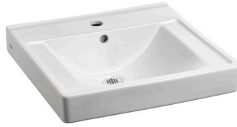
Model 9024.001EC Center Hole Only (CHO)