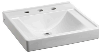
Model 9024.908EC 8" Centers Less Overflow