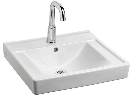
9024.001EC shown with 2064 Series Serin Faucet