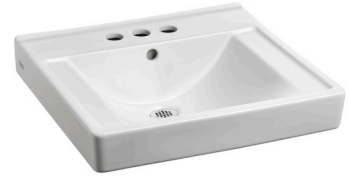
Model 9024.004EC 4" Centers