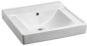
Model 9024.000EC No Faucet Holes