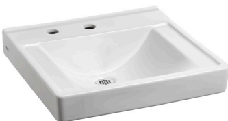
Model 9024.921EC CHO With Left Hand Soap Dispenser Less Overflow