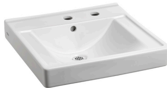
Model 9024.011EC CHO With Right Hand Soap Dispenser