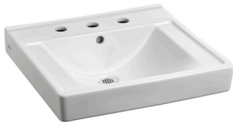
Model 9024.008EC 8" Centers