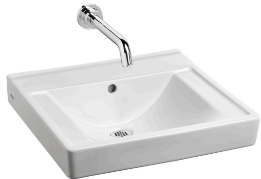
9024.000EC shown with R350 & T064 Series Serin Faucet

SEE NEXT PAGE FOR ROUGHING-IN DIMENSIONS