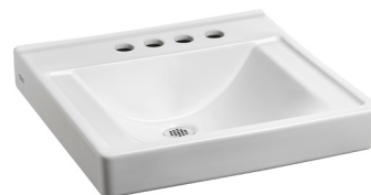
Model 9024.914EC 4" Centers With Right Hand Soap Dispenser Less Overflow