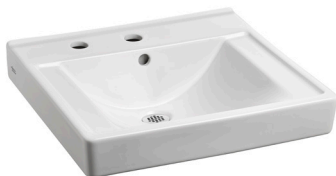
Model 9024.021EC CHO With Left Hand Soap Dispenser