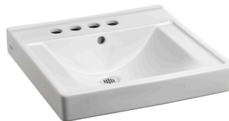
Model 9024.024EC 4" Centers With Left Hand Soap Dispenser