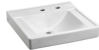
Model 9024.911EC CHO With Right Hand Soap Dispenser Less Overflow