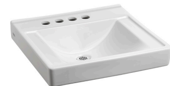
Model 9024.924EC 4" Centers With Left Hand Soap Dispenser Less Overflow