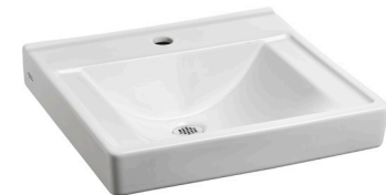
Model 9024.901EC CHO Less Overflow