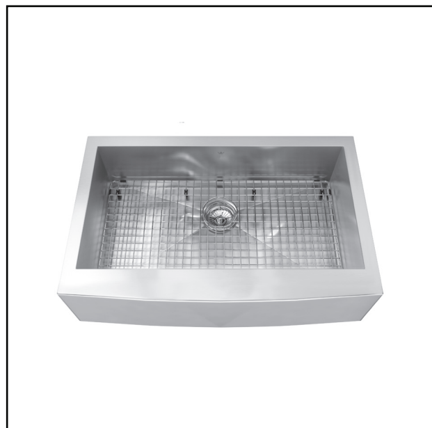
Steel Queen Apron Front