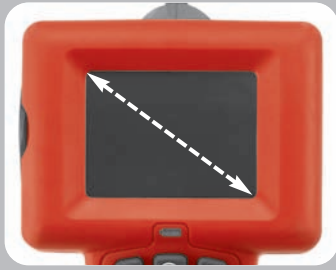
Crisp 2.4" LCD Screen