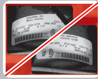
180° Digital Rotation