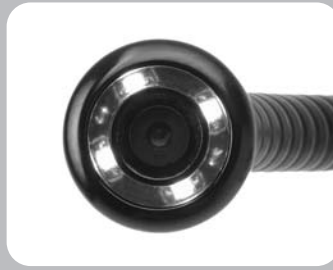
Waterproof Aluminum Imager Head and Cable with 4 Adjustable Ultra-Bright LEDs