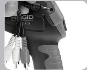
TV Out and RCA Cable