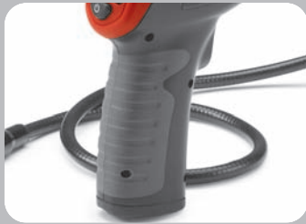
Pistol Grip Design for Easy One-Handed Operation