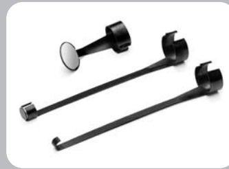
Hook, Magnet, Mirror