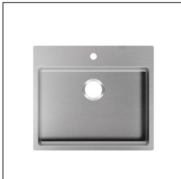
Brookmore Topmount/Drop In