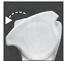
TWIST HINGE TO UNLOCK