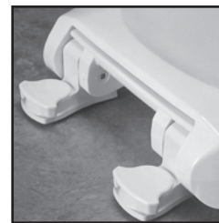
EASY•CLEAN & CHANGE™ HINGE

Ring thickness is 1/2" Ring thickness including the bumper is 13/16" Height of the seat with cover is 1-7/8"