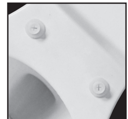
EASY•CLEAN & CHANGE™ LIFTS OFF FOR EASY CLEANING