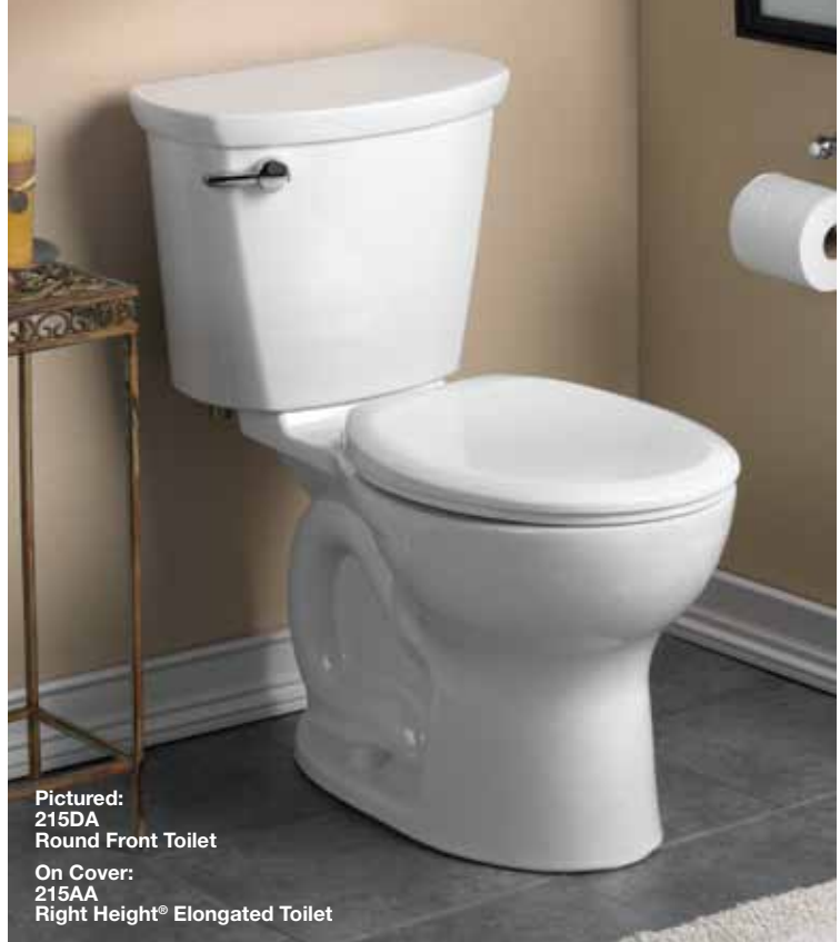
Pictured: 215DA Round Front Toilet On Cover: 215AA Right Height® Elongated Toilet