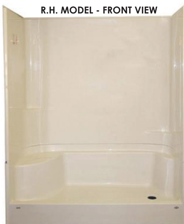
R.H. MODEL - FRONT VIEW