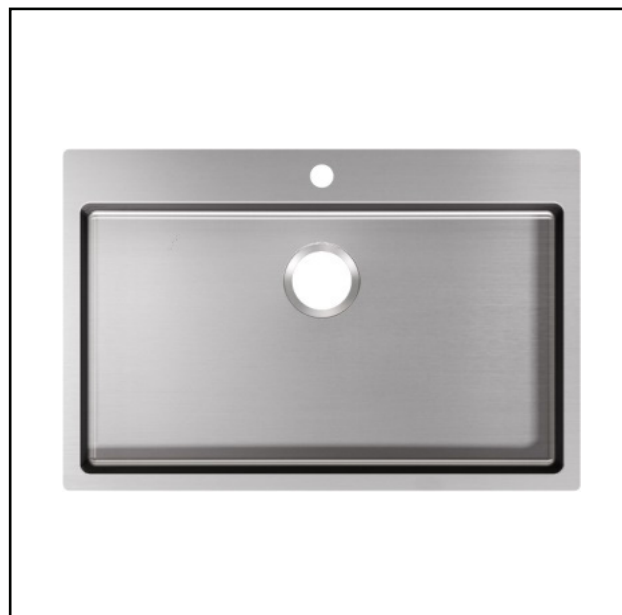
Brookmore Topmount/Drop In