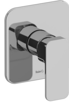
Equinox™ 1/2" Pressure Balance Trim