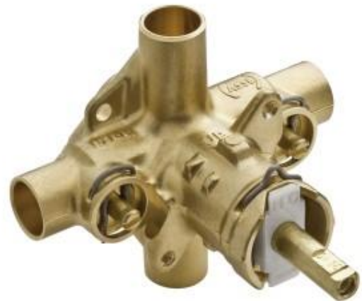
Moen Posi-Temp Valve 62370/62360