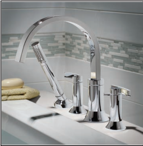
7431 901 Shown