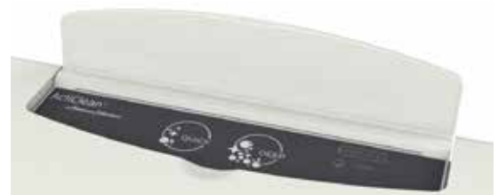
SELF-CLEANING TANK TOP DEVICE

SEE REVERSE FOR ADDITIONAL ROUGHING-IN DIMENSIONS