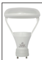
(1) 11 Watt GU24 base LED lamp/2700 Kelvin Warm White/>90CRI/750 lumens/68 LPW/ENERGY STAR 2.0 certified/25,000 hours rated average life.