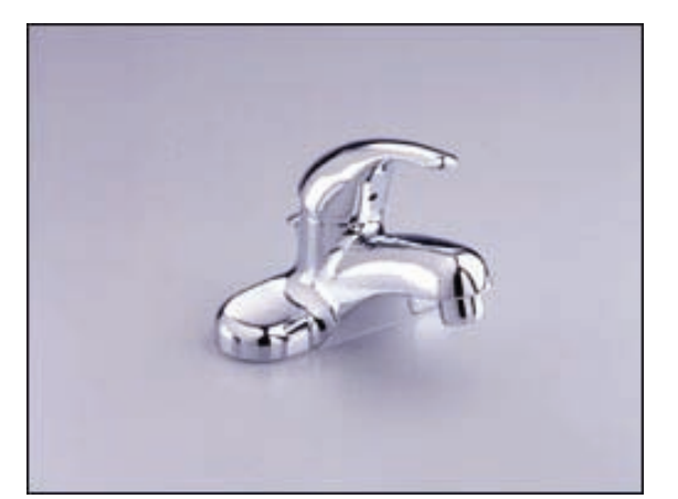
2175 562 Shown.